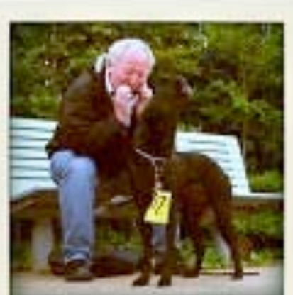
No.5 A Song for Jack, Locws International 2008, Swansea, Wales

A Song For Jack was a canine tribute to Swansea Jack a hero dog from the 1930's. Dogs were auditioned and a piece of music for them to respond to based on shifting between cmaj and dmaj. The dogs were filmed in a recorded recording studio and the music was scored for strings and performed once at the National Maritime Museum, Swansea.