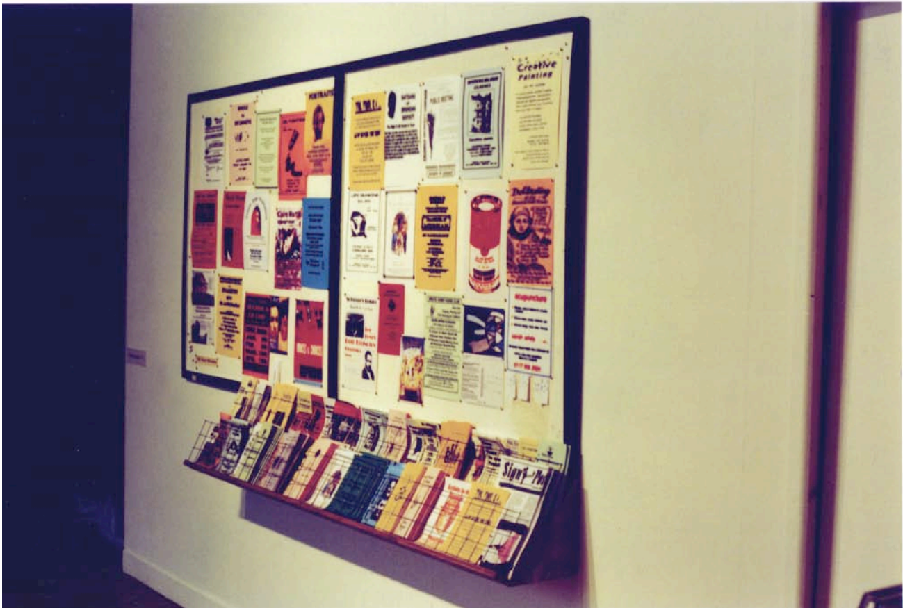
No.2 In a Big Country (dedicated to the memory of Stuart Adamson) Install view, Chapter Art Centre version 2003.

In a Big Country is an example of a series of 'prop' notice boards that were copies of existing notice boards but all the printed information was recreated as blurred and unreadable. This involved using the computer to make things unresolved and the printer to work against producing clear images.